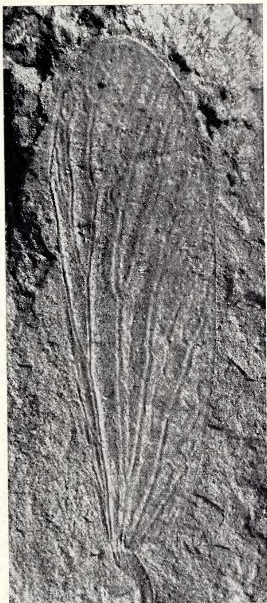
Fig. 1. Photograph of holotype forewing of Cretatermes carpenteri , new genus, new species.